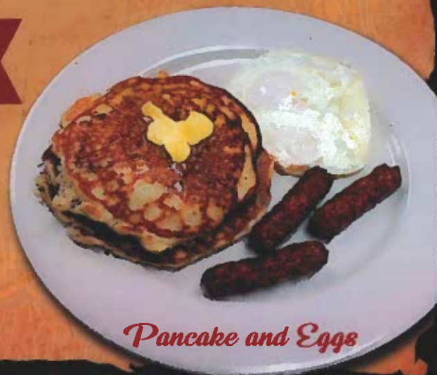
Pancake and Eggs