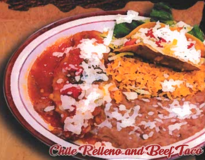
Chile Relleno and Beef Taco

Green Chile (Pork) or Red Chile (Beef or Chicken) Rice and beans inside, do not include Soup.