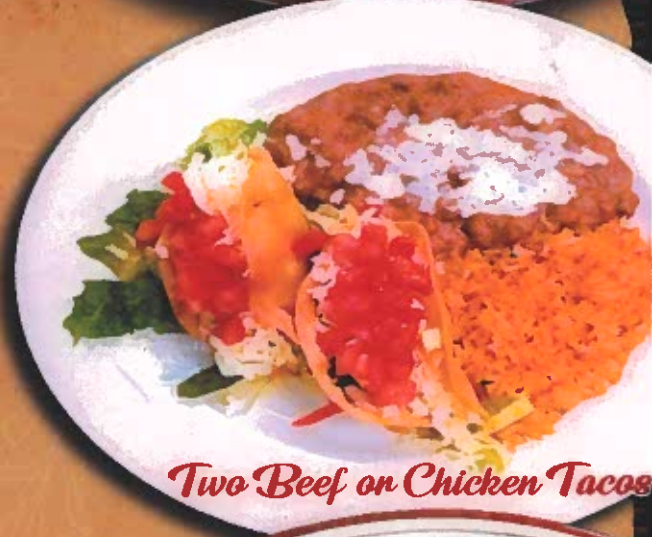
Two Beef on Chicken Tacos